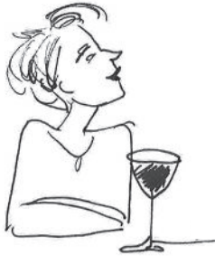
Figure 3: Leaders are good at hiding their loneliness.

Being without a home and feeling adrift is more than just an unpleasant emotion. It's dangerous, and we ignore it at our own peril. The fact is that in the absence of a positive vision of 'home', where we belong in healthy collaborative relationships, leaders naturally isolate themselves. They default into seeking the respect and admiration of others rather than looking to connect and collaborate. They dress this up with bullish statements like 'It's tough at the top!' and 'Leadership isn't for wimps', but isolation isn't a strength, or a sign of good leadership.