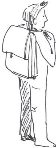
Figure 4: Carrying a vision of home with us.

Neither is this about a failure to grow up. We can recreate aspects of the home we once knew, and there is nothing wrong with having familiar things around us. But if that is all it is, it becomes nostalgia—a wistful longing for what once was and we wish was the case again. Belonging is about establishing a vision of ‘home’ that is more than just historic.